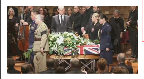
The coffin of His Excellency the Governor is carried out of his State Funeral at the Federation Concert Hall.

At the conclusion of the service, the bells of the Cathedral were rung in remembrance of those who were killed in the war. This was part of a national ringing of bells at 11:00 a.m. on the day of the anniversary of the outbreak of war.