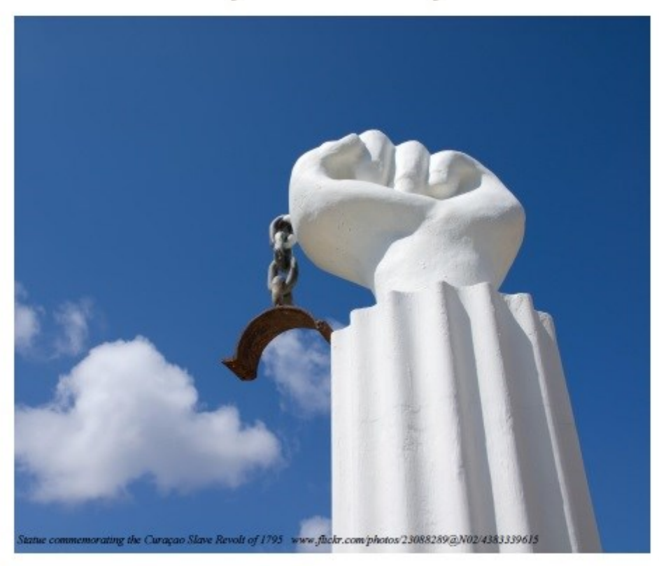
Your right hand, O Lord, glorious in power (Exodus 15.6)