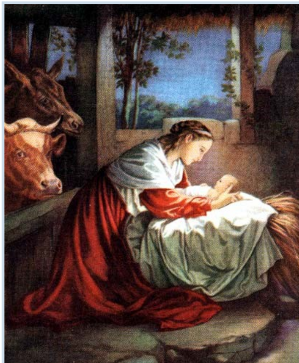
Unknown illustrator