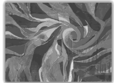
NCCA Mantle, used at inaugural service when NCCA was formed in July 1994, will be a focal point at the AGM

Please put this date in your diary NOW—and plan to be there to be part of the ecumenical journey in Tasmania!